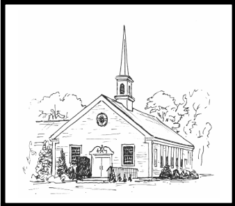
Nauset Baptist Church

We are blessed to be the stewards of our own property and building in which to meet. We have been doing our best to manage and maintain this blessing as a congregation.